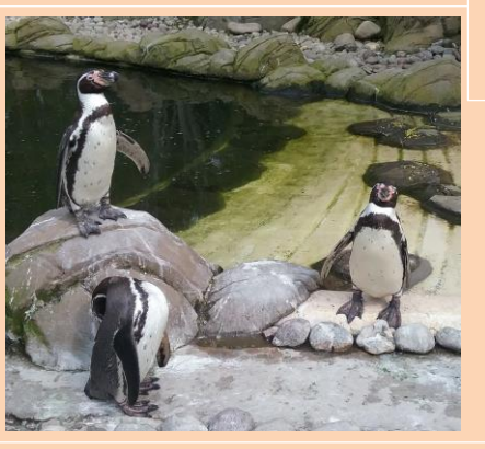
More photographs on the website very soon.