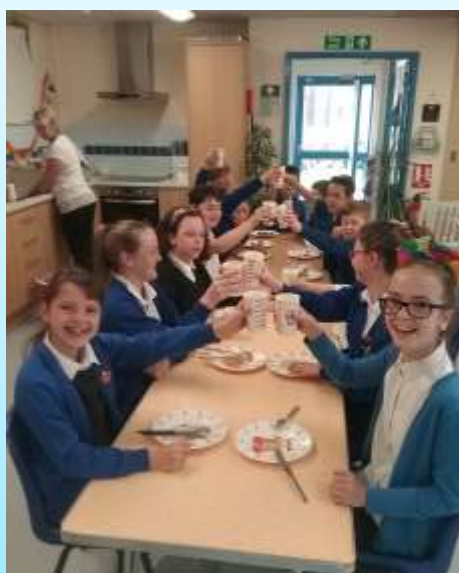
Year 6 children enjoying a pre SATs breakfast