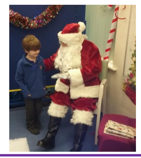
Thank you from FOBS for all your continued support.