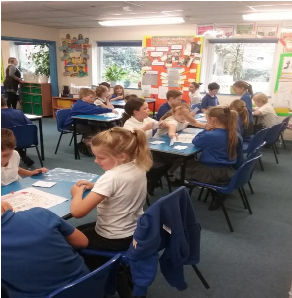
Sea Otters - £209 - Curriculum practice books for English and Maths.

Money raised has recently been used to purchase educational items and resources for all classes.