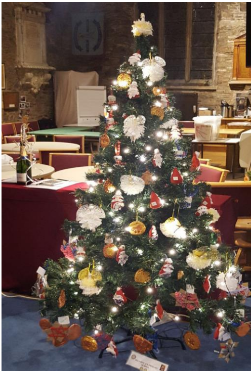
£70 - Purchase of Christmas tree for St Botolph's Church Christmas tree fayre.

Tigers - £266.81 - purchase of a range of resources to support the continuous provision, science, ICT, maths, speaking and listening.